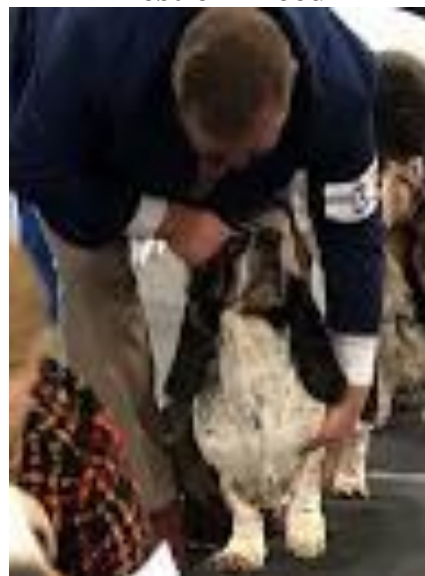
GCH-B Castle Hills Snoline Man in Black