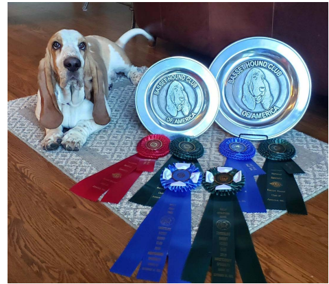
Meadow Moon of the Ozarks