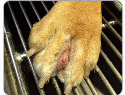
Photographs above illustrate how efficiently a foxtail can migrate into a dog's tissue. Please check yards and outdoor areas for these very dangerous weed seeds.

PLEASE REMEMBER TO PAY YOUR DUES IF YOU HAVE NOT ALREADY DONE SO. MAIL CHECKS TO: