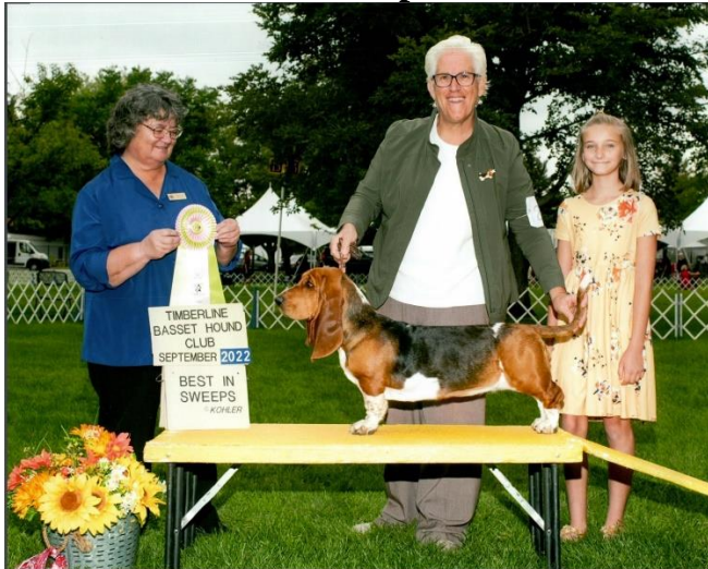
“ROCKSTAR’S RUBY TUESDAY, CGC