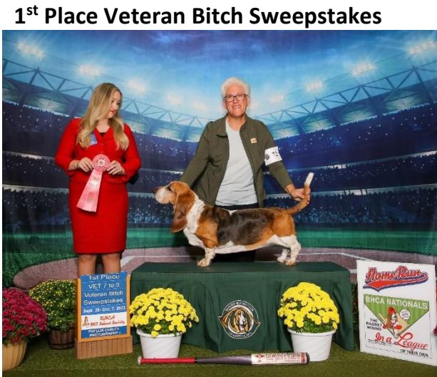
“Maddie” GCh Ch RockStar’s She’s The One, TD, CGCU