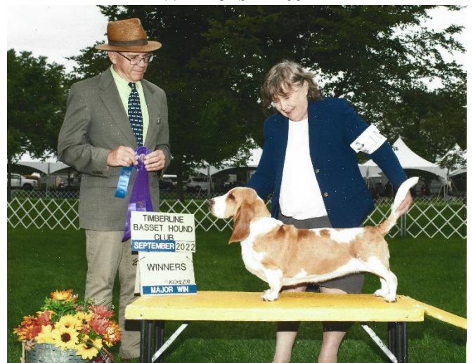
HOUSE OF HOUNDS BRIE O’BRISTLECONE