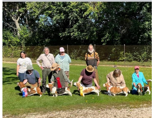
House of Hounds Brie O’Bristlecone