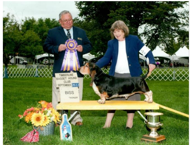
CH BRISTLECONE’S BUSHWHACKER TD