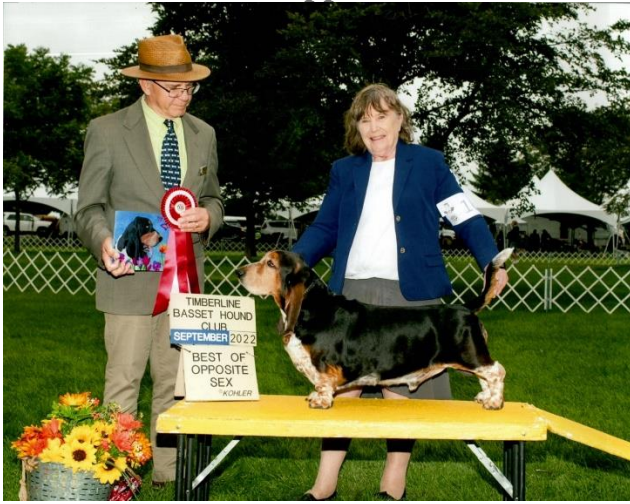
CH BRISTLECONE'S BUSHWHACKER TD