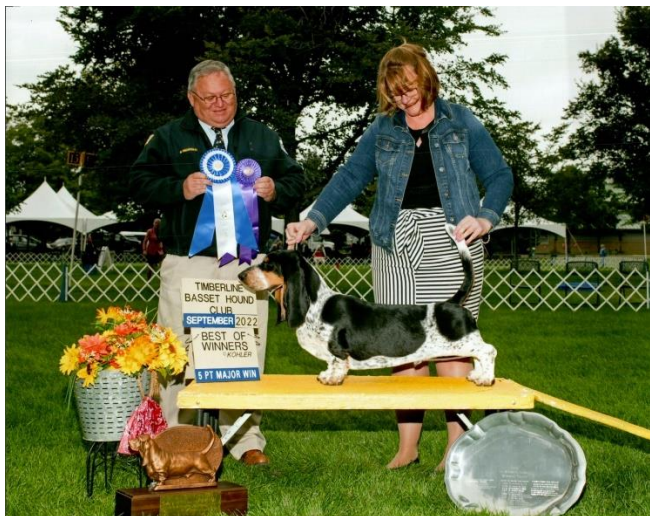
FIRST CLASS LOCO BOY LIVING LIKE LARRY