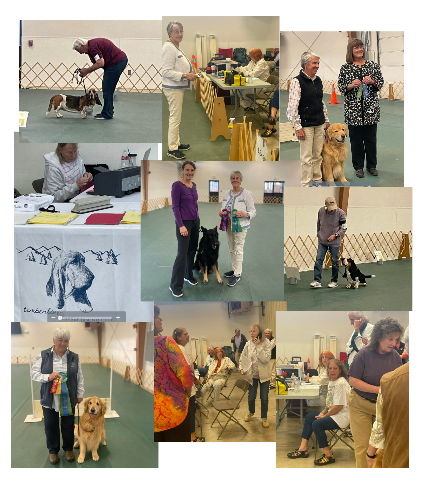
Some candid shots of the happenings at our all breed obedience//rally trials May 19-21. Happy winners, hard working club members, great judges. Thanks to everyone who volunteered.