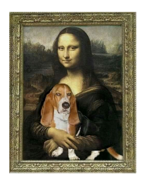
Thanks to everyone for sending in dues money!!