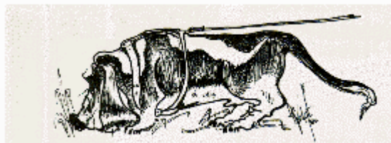
Artwork by Dietrich Voigt

Entries have closed and we've received 4 TD entries and 10 TDX entries. The draw has taken place with 6 TDX alternates. Let's hope for good weather and lots of passes. Here is the current worker list: